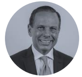
João Doria São Paulo's Governor