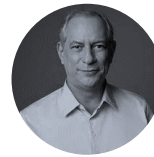
Ciro Gomes Ex-minister