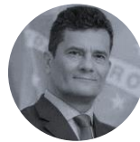
Sergio Moro Ex-judge