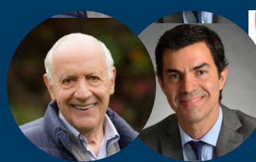
Roberto Lavagna – Juan Manuel Urtubey

Consenso Federal seeks to position itself as the third alternative between officialism and Kirchnerism. Roberto Lavagna remarks the necessity for the restructuring of the country's economic plan, appealing to its management during the Nestor Kirchner administration.