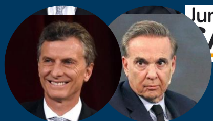
Mauricio Macri – Miguel A. Pichetto

The electoral formula integrated by the current President and the former Peronist Senator, will seek re-election by appealing to the strongholds of Cordoba and the City of Buenos Aires, where Mauricio Macri had obtained its best results in the 2015 elections.