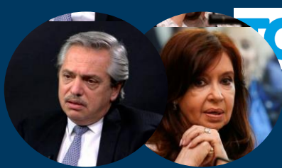
Alberto Fernandez – Cristina Fernandez de Kirchner

This front represents the main opposition force that will seek to regain the presidency in the first round. Alberto Fernandez is looking for the support of the Peronist governors who have given important victories for this bloc in provincial elections.